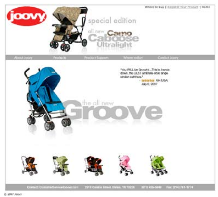
Look for these other Joovy products

Please log onto www.joovy.com to register your new Joovy product.